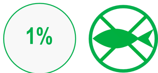
Non-native invasive species