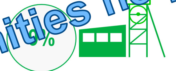
Pollution abandoned mines