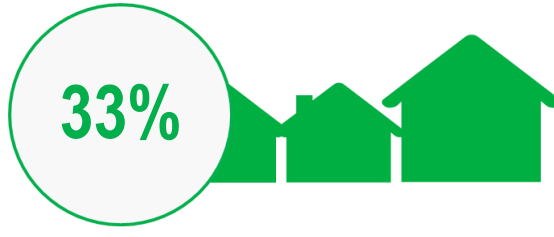
Pollution from waste water