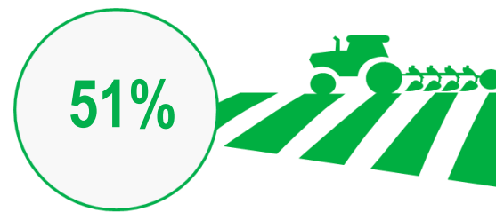
Pollution from rural areas