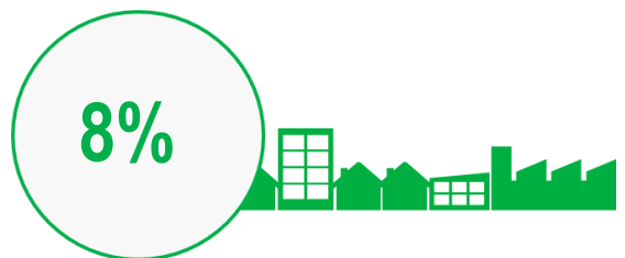
Pollution from towns, cities and transport