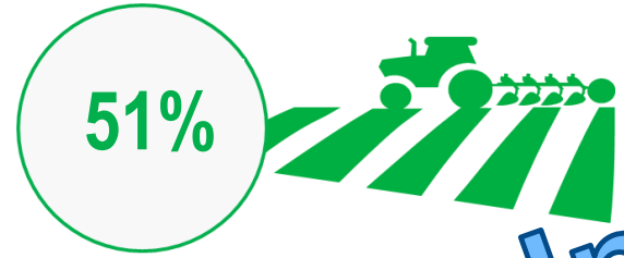
Pollution from rural areas