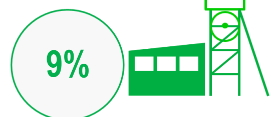
Pollution abandoned mines