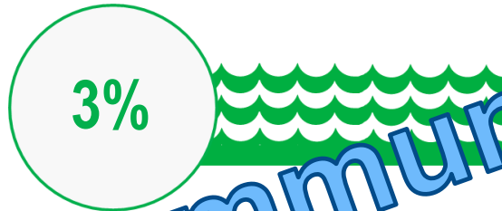
Change to the natural flow and level of water