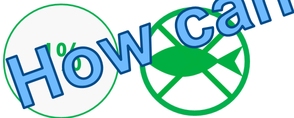
Non-native invasive species